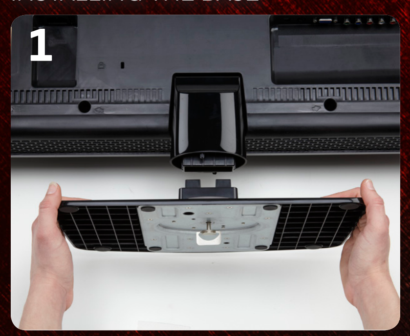
Place the TV screen-down on a clean, flat surface. To prevent scratches or damage to the screen, place the TV on a soft surface, such as carpet, rug, or blanket.